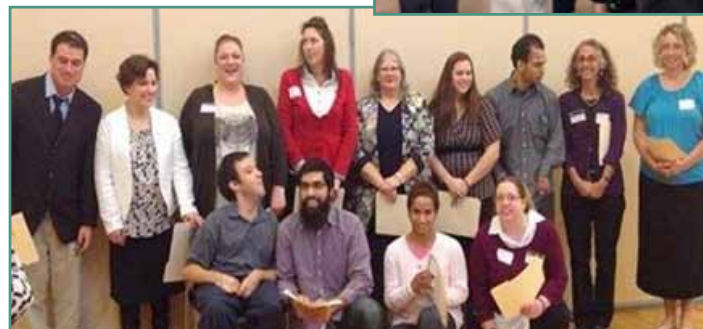
◀ Rochester graduates