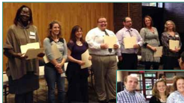
◀ Schenectady graduates.