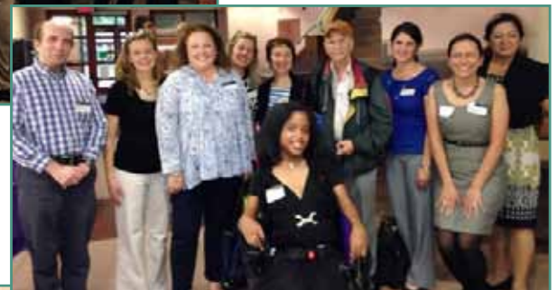
New York City graduates ▶