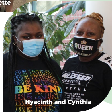
Hyacinth and Cynthia

350+ children and adults used Self-Direction to manage their services