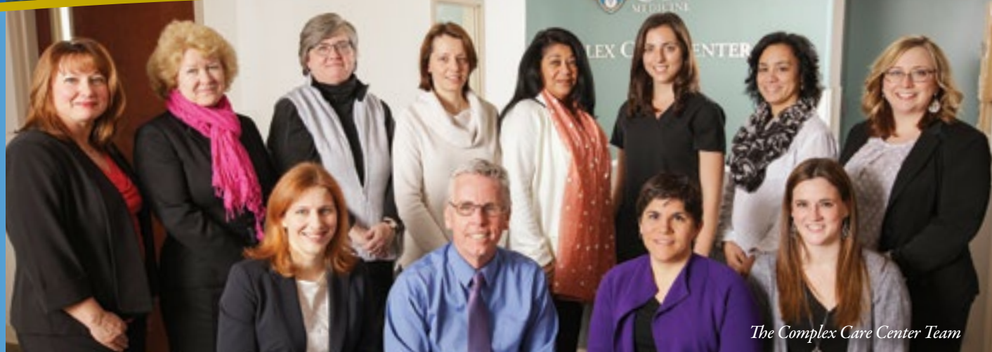
The Complex Care Center Team

The Complex Care Center offers a variety of services and supports to meet the needs of referring providers and community agencies, as well as the individual goals of patients and their families.