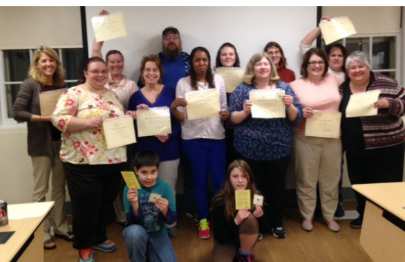
Graduates of the Family Empowerment Series