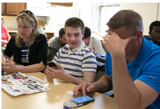
A family participating in Creating A Life After High School