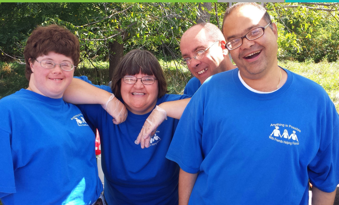
Friends Helping Friends hold their annual hot dog sale.