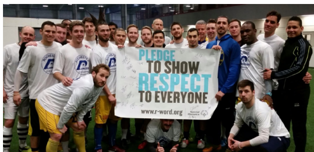
Rochester Lancers took the pledge to end the R-word

Goodshop (Goodsearch) LAOH, Inc.